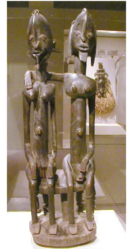
Dogon Primordial Couple, Metropolitan Museum, NY