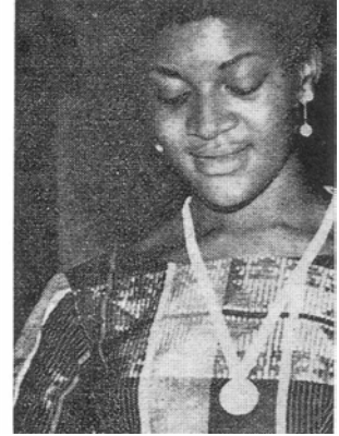
Example of jijora in Frank Willett's African Art .