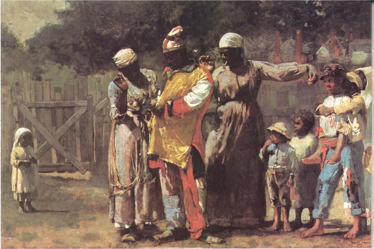
The Carnival , painted in 1877, is one of a series in which Homer documented the lives of the newly freed blacks in Petersburg, Virginia. Strips of cloth on the Harlequin costume derive from African ceremonial dress. (Metropolitan Museum of Art)

The painting was an immediate sensation. Homer would paint for 43 more years, but Prisoners from the Front was always, in his day, considered his greatest painting. It was mentioned so frequently--often to disparage later work--that Homer eventually remarked, "I'm sick of hearing about that picture. "