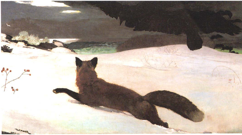
Dark forms of half-starved crows loom above a fleeing fox in one of Homer's most dramatic and tragic works, Fox Hunt , from 1893. With the advantage of numbers, the crows could vanquish the prey, its escape slowed by the deep snow of Maine.

The masterpiece called Fox Hunt (1893), his largest painting, has no humans in it at all. But the situation, again, is one of danger and death: a flock of starving crows attacks a bright red fox that is caught in deep snow. The fox--usually a predator itself--is the "point of view character": the crows hovering overhead seem terrifying, like winged death. But the fox, like the black man in The Gulf Stream , is not regarding the source of danger; instead, its head is turned toward the quiet sea, lit in the distance by a winter sun--as if looking beyond its own death.