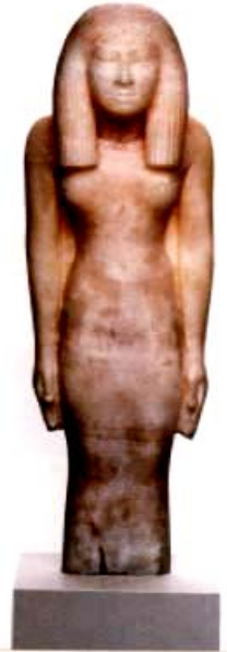
The Old Kingdom Egyptian alabaster statue likely depicts a woman of royal birth.

Pharaohs and their families led pampered lives, attended by royal hairdressers and royal manicurists. Still, the comforts of the Old Kingdom were relatively basic. The 4,600-year-old figure of what is probably a young princess, elegantly modeled in translucent Egyptian alabaster, is slim but muscular. "It's a reminder of how simple life was," Russmann says. "Even a royal woman still got around mostly by walking." The knee-hobbling dress the young woman wears is evidently a fiction. "Linen is the least stretchy fabric I know of. How could she have gotten into a linen dress that tight, much less moved in it?" Linen dresses recovered from tombs of the period are just baggy tubes with shoulder straps.