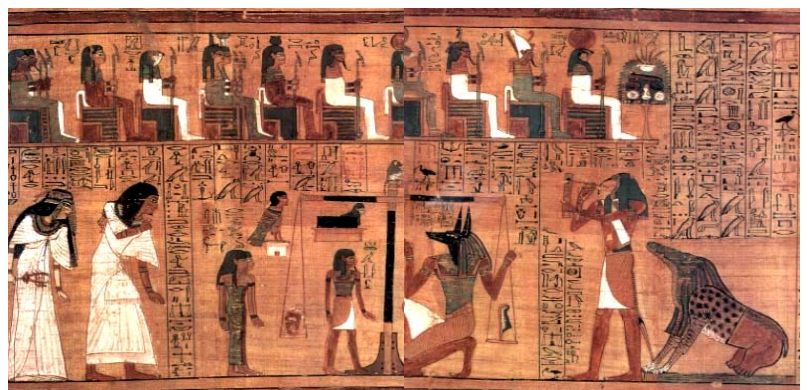
For ancient Egyptians, entering the afterlife was literally a moment of truth. This scene from the c. 1200 B.C. Book of the Dead, Papyrus of Ani, portrays the weighing of the royal scribe's heart against a feather representing truth.

of mummiform gods looks on. Should his heart fail to