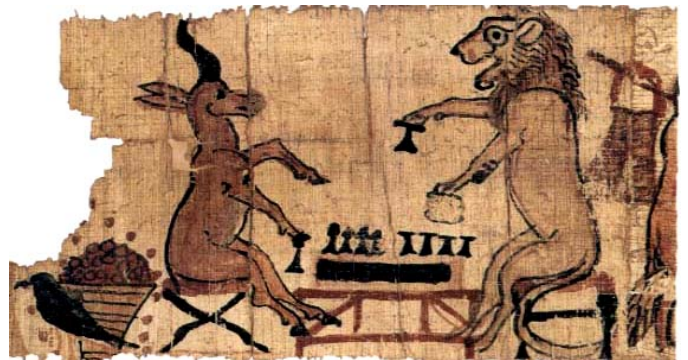
An antelope and a lion pair up to play a friendly board game in this papyrus with satirical vignettes (c. 1295-1069 B.C.). Many such scenes were done in Thebes during the New Kingdom.

Skilled artisans occupied a social rung somewhat below scribes. Archaeologists have pieced together a wealth of information from papyri and ostraca (leftover stone chips used as a poor man's papyrus) found in the ancient Theban village of Deir el Medina. The town was full of painters, sculptors, carpenters and other skilled laborers who put in eight-day shifts decorating the rock-cut tombs of the Valley of the Kings. They left behind records of crimes, seductions and the world's first-known strike. (Workers were paid not in money but in food, drink and other amenities, delivered by slaves. In this case, deliveries were running late.) An eye-opening example of a Theban artist-scribe working in a lively, whimsical style is a scroll ( right ) depicting animals behaving like humans, possibly as a gibe at the ruling class.