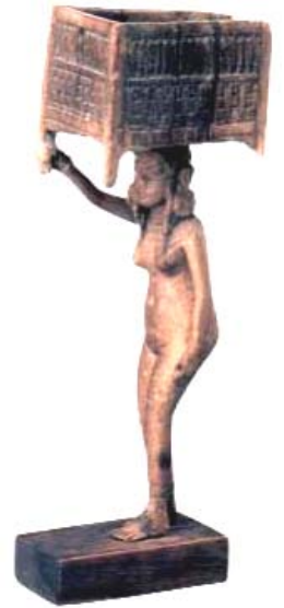
The hairstyle of this servant bearing a cosmetic box suggests she was a foreigner.