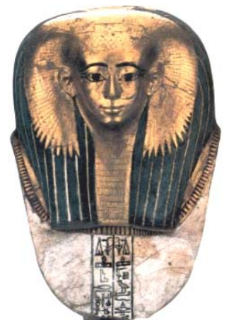
Made of cartonnage—linen cloth stiffened with plaster—the richly gilded mask (c. 1500 B.C.) boasts attributes of the gods—gold skin, and dark blue hair the color of lapis lazuli.