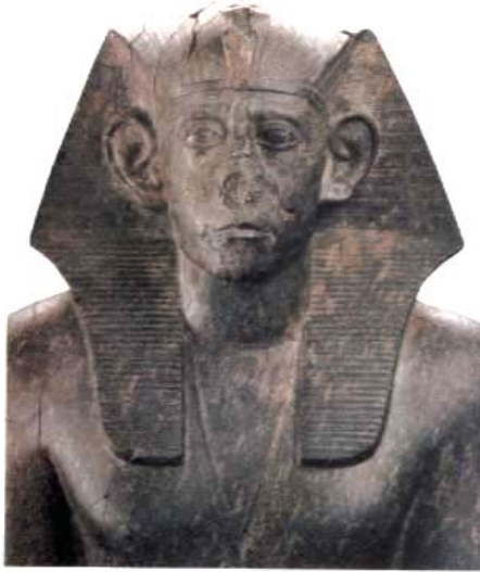
Sesostrius' distinctive features are artfully chiseled in this famous granite statue.

Egyptian statues and inscriptions—whether sealed off in crypts or displayed outside temples—were always utilitarian. They invoked spells and charms and ensured admittance to the afterlife (welcomed as a pleasant continuation of one's natural years). In a funerary ceremony known as the "opening of the mouth," priests anointed a statue's lips and nose to allow it to drink, eat, speak and breathe, and thus live forever, once inhabited by the soul of the deceased. Mummies received the same treatment. Despite their art's religious purpose, however, it would be wrong to think the Egyptians had no conception of artistic beauty. New Kingdom visitors to older tombs in several cases scratched graffiti on the walls remarking that what they found was "more beautiful than anything."