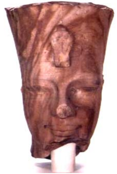
This 3,000-pound quartzite head (c. 1390 B.C.) of Amenhotep III capped a colossal statue.

Cosmetics had long been a staple of Egyptian life—their absence as payment in kind was a chief grievance in the Deir el Medina strike. Cosmetics were more than a beauty aid. Men used them as a sunscreen and skin lubricant. Both men and women painted their faces from brow to nose in green and, later, black paint, in part to mimic the protective eye of the