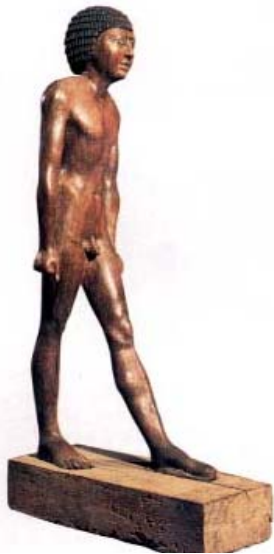
This Old Kingdom striding figure of the provincial official evokes a sense of tension.

Compared with the mass of peasants, even a provincial bureaucrat held an exalted rank. One such official, a man named Meryrahashtef, had himself immortalized in a single block of imported ebony ( left )—one of a number of small wooden statues of nonroyal subjects that appeared toward the end of the Old Kingdom. The nude figure is nothing like the chesty, symmetrical pharaohs one usually associates with Egyptian art. The man's slender torso bends forward and twists tensely to one side as his elongated left leg takes a giant stride forward. Radiating coiled energy, Meryrahashtef seems to be rushing to an appointment. The redoubtable Sir W. M. Flinders Petrie, the father of scientific archaeology, unearthed the remarkable piece in a debris-filled burial shaft near Cairo in the winter of 1920-21. As a funerary sculpture, it may have played some role in currying favor with the gods who ruled the afterlife, but precisely what is a mystery.