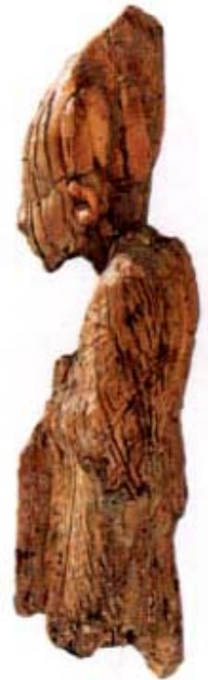
The small figure of a king is from 3000 B.C.E.

By the late 1800s, the British Museum had a staff of trained Egyptologists, and the collection was growing in volume and scope. By the 1920s, the Egyptian galleries contained 57,000 objects. Today, there are more than 100,000, many from the museum's ongoing excavations in Egypt and Sudan.