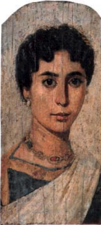
Rendered in a non-Egyptian, Hellenistic style, this Roman-period portrait of a young woman in Greco-Roman dress was made as a mummy mask.