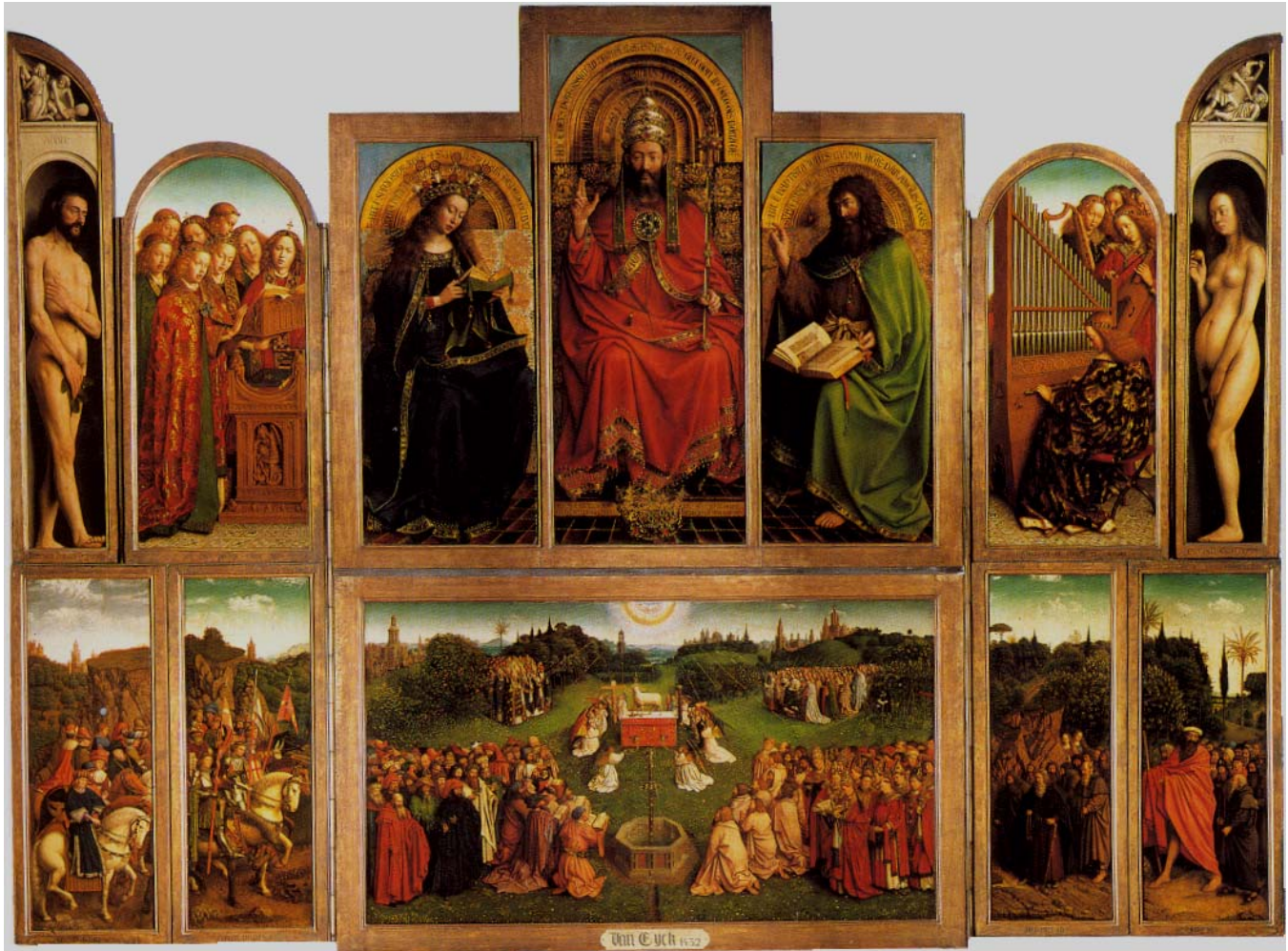
Hubert and Jan van Eyck, The Ghent Altarpiece (open), completed 1432. Tempera and oil on panel, about 11 x 15ft (3.35 x 4.57m). St Bavo, Ghent.