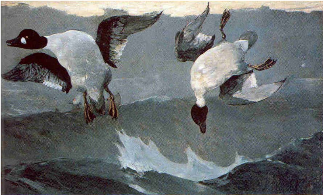
In late works such as Right and Left from 1909, Homer explored the issues of destiny and mortality. The ducks are caught at the moment of their being hit by a blast from a shotgun. National Gallery of Art, Washington, DC

But Winslow Homer was not so much of a curmudgeon as he seems. He respected and loved his brothers, and was generous to family and neighbors (an ill nephew received a check from Homer with the gruff note: "No thanks for this"). For all his crankiness to strangers, and the isolation that is apparent in his paintings, he was not unhappy. "My home here is very pleasant, I do not wish a better place ," he wrote. And again: "The life that I have chosen gives me my full hours of enjoyment for the balance of my life. The Sun will not rise, or set, without my notice, and thanks. "