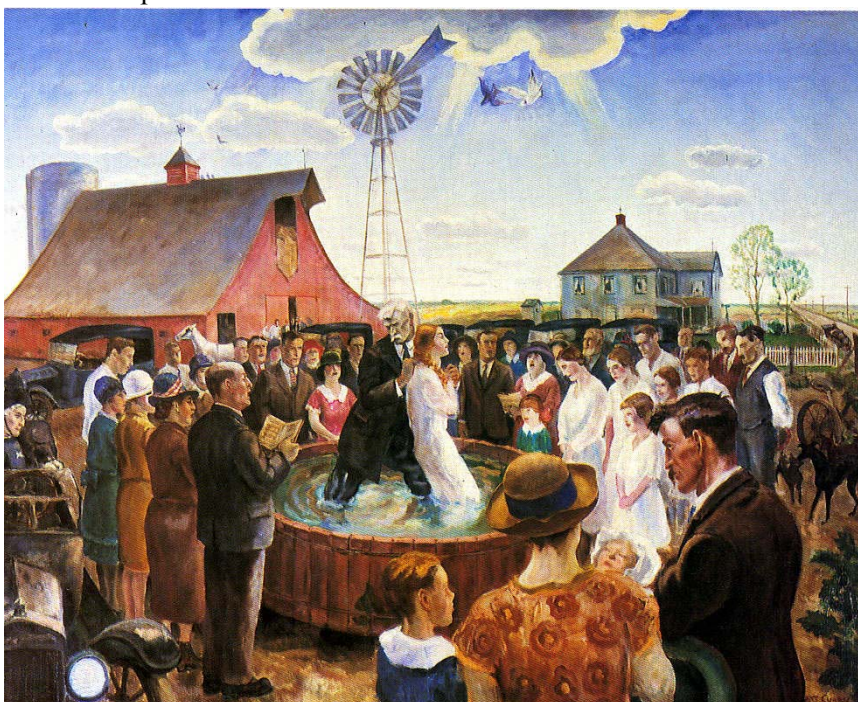
Curry, Baptism in Kansas , 1928, o/c, 40 x 50, Whitney Museum of American Art, gift of Gertrude Vanderbilt Whitney.

At its best Curry's art has the power to transcend region, and that, in the end, is what makes it such a revealing window into a time and a place. Baptism in Kansas , painted in 1928, established Curry as a master storyteller. Drawing upon his innate feeling for the human form, his profound formative experiences as a Scottish Calvinist, and the growing national interest in religious fundamentalism, Curry found in this religious rite a potent subject for his art. Baptism by submersion in a farm tank in rural Kansas was, like many of the subjects of his early canvases, a recollection of Curry's childhood.