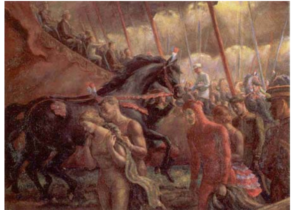
Curry, The Runway , 1932, oil on masonite-process fiber building board, 30 x 397/8, Swarthmore College Art Collection.

Curry, John Brown , 1939, oil and tempera on canvas, 69 x 45, The Metropolitan Museum of Art, Arthur Hoppock Hearn Fund.