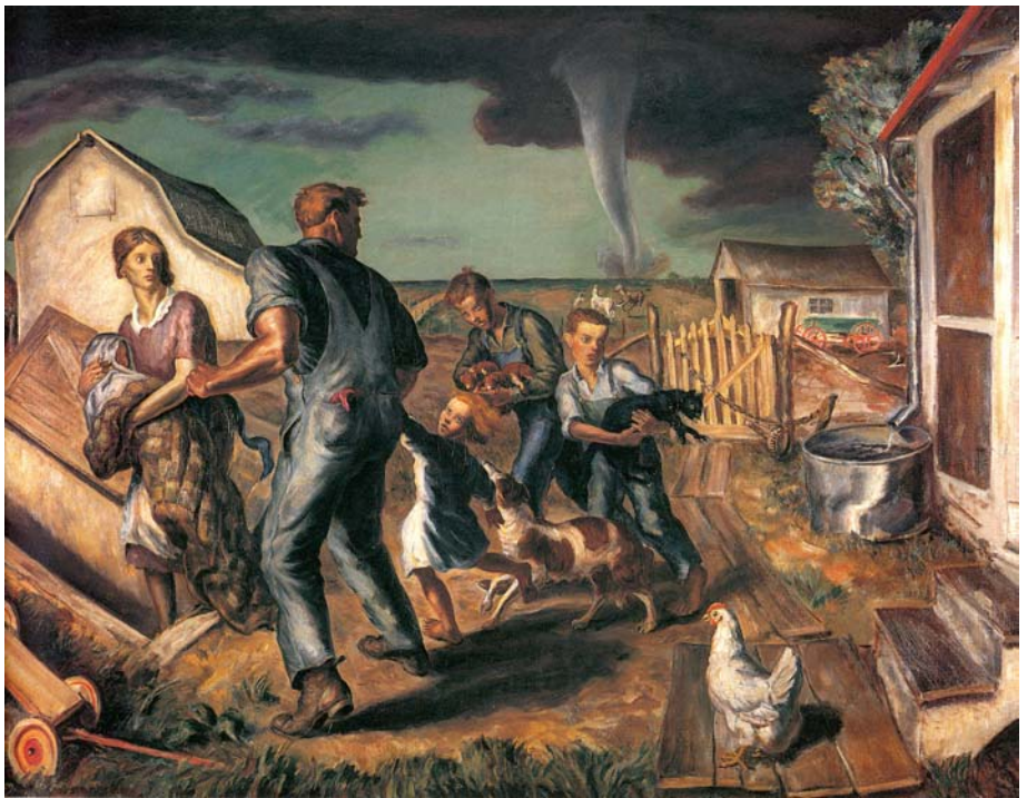
Curry, Tornado , 1929, o/c, 461/4 x 601/2, Muskegon Museum of Art, Hackley Picture Fund purchase.

Through two decades of dramatic change, Curry held fast to an art that took as its foundation the relation of humankind to nature and of men and women to one another. Inevitably this son of a Kansas stockman saw that interconnectedness most clearly in rural life. In his paintings, inspired by the lives of people of rural Kansas, Curry gave form to issues that extended far beyond America's Middle West. He articulated both the complex concerns of his generation and universal human experiences. He elevated the rural Midwestern landscape to a higher level of discourse—to a consideration of social and spiritual values.