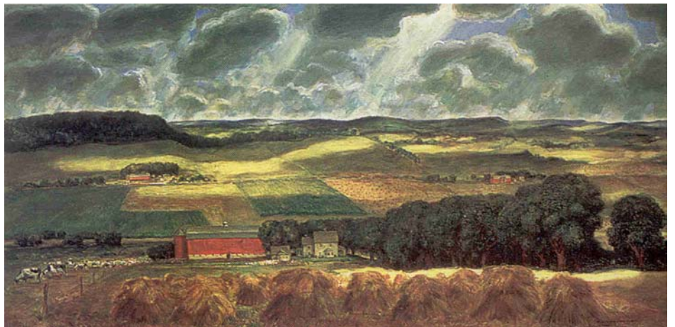
Wisconsin Landscape, 1937-1939, o/c, 42 x 84, The Metropolitan Museum of Art, George A. Hearn Fund.

These were years of reflection rather than innovation for his art. They were also years of discouragement, as the painter struggled with public scrutiny. The Wisconsin years should have signaled fulfillment for a populist like Curry, but, ironically, experiences in the last decade of his life shook his faith in populism. Although Curry's works brought him critical acclaim and the admiration of fellow artists, they failed to garner him wide public acceptance. They failed to appeal to "his people." Fellow Kansans denigrated his Topeka murals, driving him away from the project in disgust, his work never completed. Curry could not recover from the hurt. Wisconsin Landscape , painted at the request of a group of the country's leading agriculturists, was refused by those who had commissioned it.