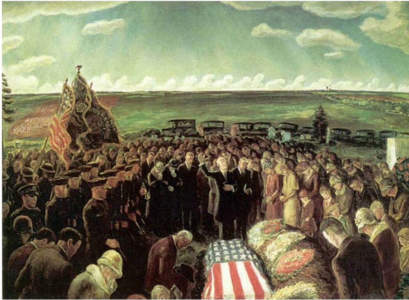
Curry, The Return of Private Davis from the Argonne , 1928-40, o/c, 38 x 52, The Warner Collection of Gulf States Paper Corporation.