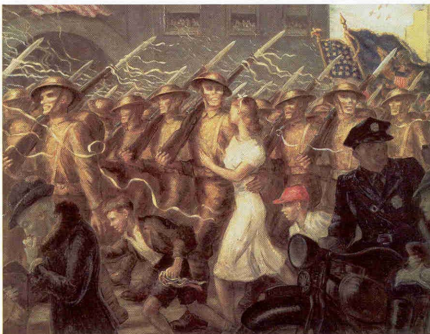
Parade to War, 1938

By 1936 Curry had earned official recognition as a painter of and for rural people. Yet he died only a decade later misunderstood and disappointed. Upon his death in 1946, the Wisconsin State Journal paid him the following tribute: He was not content in the artist's attic. He was a stranger to the ivory tower; He knew what art means in its deeper significance and he toiled to show it to others, to inspire an appreciation and an active interest in it for thousands of people to whom it had been something a million miles away from their own lives his Wisconsin rural artists, farmers and village housewives were his pride and joy. A youngster he could help with a brush or an idea was a thrill to him beyond his biggest mural. ["John Steuart Curry," Wisconsin State Journal, 30 August 1946.]