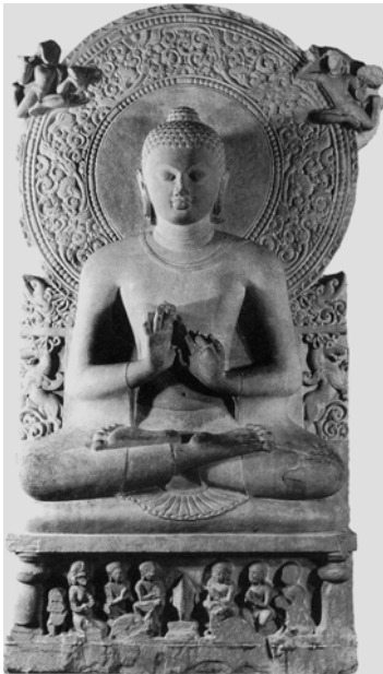
6.21 Teaching Buddha from Sarnath, Gupta, 5th century CE. Sandstone, 5ft 2ins (1.58m) high. Sarnath Museum.

of the religious art of the world (6.21). The superb technical accomplishment of the carving may perhaps derive from Gandharan practice, but has been further refined by an exquisite precision of detail and by a sensuously subtle definition of form unlike anything in the West.