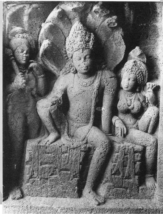
6,23 Nagaraja and his wives, Ajanta (cave 19), late 5th century CE.