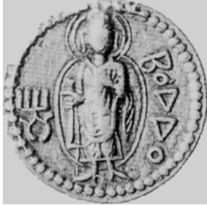
6,15 Above Gold coin of Kanishka showing the Buddha, late 1st to early 2nd century CE. Formerly Museum of Fine Arts, Boston (Seth K. Sweetser Fund).

whose precepts and example were to be followed, but as a god who had existed eternally, like Brahma, without beginning or end. In this form Buddhism became more easily reconcilable with other religious beliefs both in India and, as we shall see, China and Japan. From a transcendental viewpoint, the historical Buddha came to be seen as an illusion in an illusory world; this paradoxically permitted him to be represented by images, for all images are illusory too. At a lower intellectual level the Mahayana opened the door to the worship of a Buddhist pantheon of deities visualized anthropomorphically like, and sometimes together with, the deities of other religions. Most important among them were the Bodhisattvas or Buddhas-in-the-making, who, for the salvation of humanity, renounced the Nirvana they were capable of attaining.