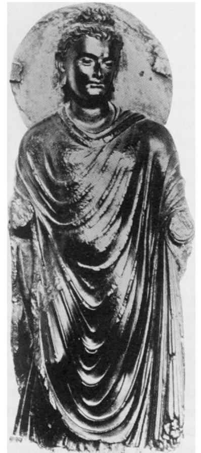
6,16 Standing Buddha from Hoti-Mardan, 1st to 2nd century CE. Formerly Guides' Mess, Hoti-Mardan, Pakistan (present location unknown)

One of the earliest Gandharan Buddhas is also among the most Classical, in a European sense (6,161). Drapery hanging in loose folds, but indicating the form and movement of the body beneath, is like that on contemporary statues of deified Roman emperors or, more appropriately, of the Muses, who brought to humanity the purifying power of poetry and divine wisdom (5,54; 5,76). The pose has an enlivening twist typical of Late Antique sculpture and the head recalls a Greek Apollo. Wavy hair conceals the ushnisha , and only the urna , a tuft of hair between the brows, and elongated earlobes, remain as distinguishing marks of the Buddha. For the elevated but gentle expression of a heart at peace so eloquently conveyed by this noble figure there was, however, no precedent in the