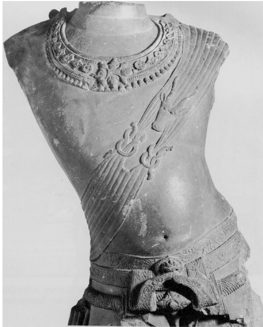
6,22 Torso of Bodhisattva from Sanchi, post-Gupta (?), 5th century CE. Sandstone, 34 1/4 ins (87cm) high. Victoria & Albert Museum, London.