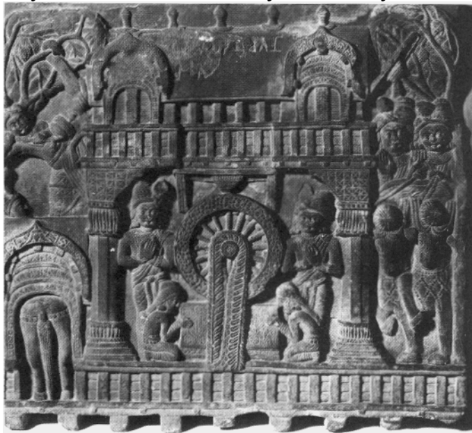
6.14 King Prasenajit visits the Buddha, detail of a relief from the Bharhut stupa, early 2nd century BCE. Red sandstone. 18 7/8 ins (47.9cm) high. Freer Gallery of Art, Smithsonian Institution. Washington DC.

The early Buddhists revered Sakyamuni as a mortal teacher who attained enlightenment and finally Nirvana – the release of the spirit from its incarnations. This consummation could for them be expressed visually only by abstract forms, such as that of the stupa. There was no means by which his person could be represented. 'For him who (like the sun) has set, there is no longer anything with which he can be compared', declares one of the earliest Buddhist texts. But a religion with the steadily growing popular appeal of Buddhism called for icons as visual aids to doctrine, and stupa gateways were carved with reliefs illustrating his life as early as the late second or early first century BC. A fine example from the stupa at Bharhut in north-central