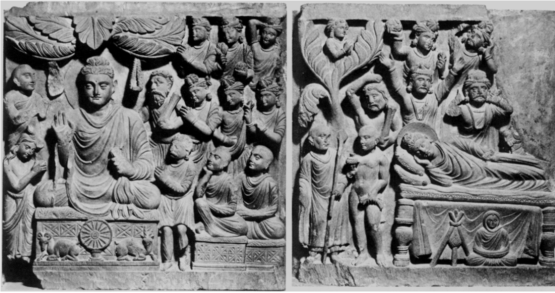
6.20 Details of relief from Gandhara showing the First Sermon in the Deer Park and the Death of the Buddha, Kushan, late 2nd to early 3rd century CE. Dark gray-blue slate, 26 3/8ins (67cm) high. Freer Gallery of Art, Smithsonian Institution, Washington DC.

full of vitality and jostling movement, while the Buddha is withdrawn in static detached monumentality, like a heroic-scale statue surrounded by living worshippers. He is represented as a god, far removed from the joys and sorrows of humanity, as he was to be in later Buddhist art.