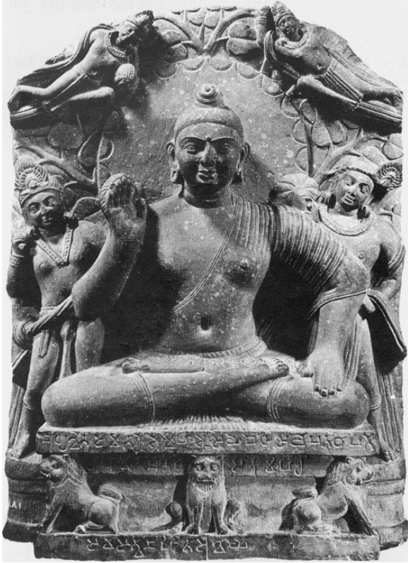
6,18 Seated Buddha from Katra, Mathura, India, 2nd century CE. Sandstone, 27 1/4ins (69.2cm) high. Government Museum, Mathura.

India to create a sublime image of Eastern serenity, an Orientalized Apollo. The meeting of East and West in the art of Gandhara brought forth a new type of human beauty, which was to haunt not only the Indian image of the Buddha but also, and perhaps more strongly, the Chinese.